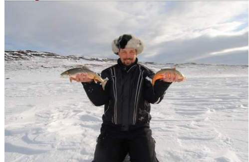
Ice fishing for arctic char