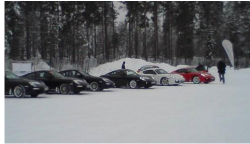
From a special arrangement we had

We have 3 sledges and you will be 2 person/sledge 2/1.