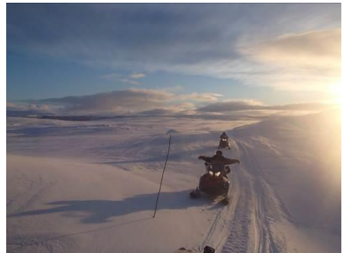
Snowmobile at the arctic circle